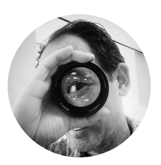
Jay Tayag Photographer