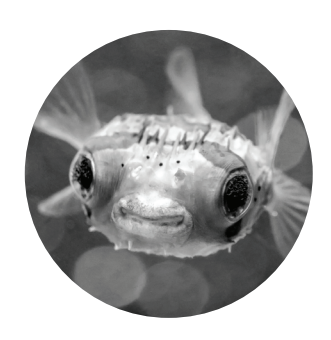
Robin Riggs Photographer